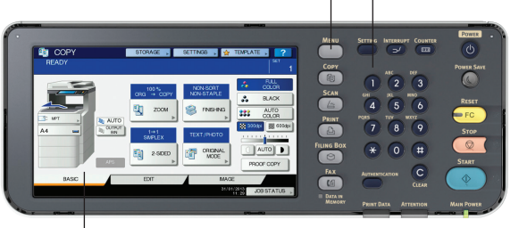
Intuitive 9" touch-screen display: simplifies navigation, enhances user productivity, enables access to web-based applications

Alphanumeric keypad: enter fax numbers, codes and quantities with a touch