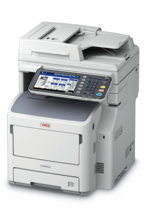
MPS5502mb+ Up to 55 ppm¹; 630-sheet standard paper capacity, upgradable to 3,160 sheets; 20-sheet convenience stapler