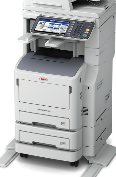
MPS5502mbf+ - Up to 55 ppm¹; 1,160-sheet standard paper capacity, upgradable to 1,690 sheets; 50-sheet in-line stapler