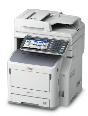
MPS5502mb+ Wireless – Up to 55 ppm<sup>1</sup>; 630-sheet standard paper capacity, upgradable to 3,160 sheets; 20-sheet convenience stapler; wireless LAN