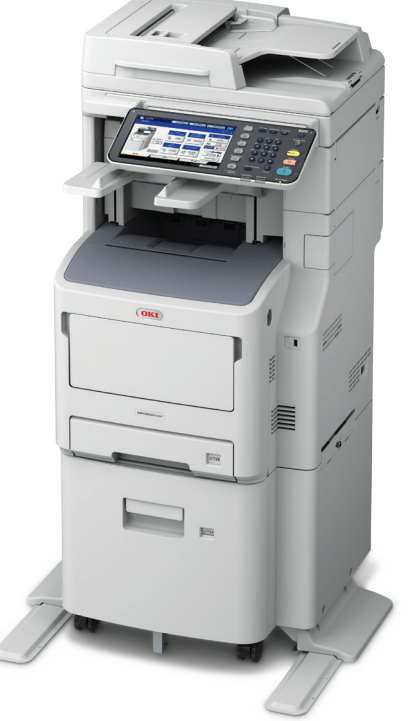
MPS5502mbfx+ – Up to 55 ppm¹; 2,630-sheet standard paper capacity, upgradable to 3,160 sheets with optional 530-sheet 2nd paper tray; 50-sheet in-line stapler