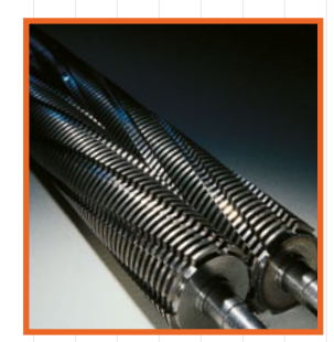
CARBON HARDENED STEEL CUTTING KNIVES unaffected by staples and clips