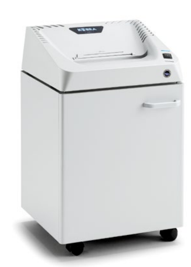
TRADE AGREEMENT ACT (TAA) COMPLIANT