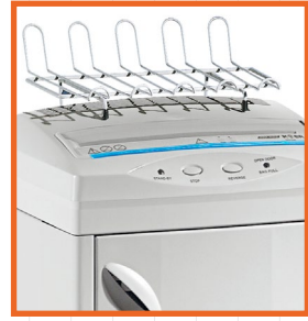
TOP SHELF (OPTION)

Power management system with illuminated indicators for power saving in stand-by mode