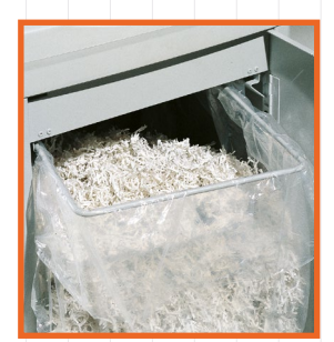
FRONT DOOR FOR EASY EMPTYING of collection bag (capacity of 1.000 sheets in straight cut)

CARBON HARDENED STEEL CUTTING KNIVES unaffected by staples and clips.