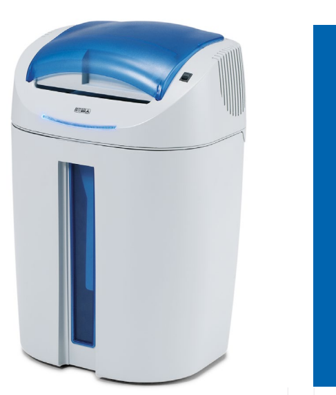
TRADE AGREEMENT ACT (TAA) COMPLIANT CERTIFICATION MARKS: CB - CE - CSA

* Capacity varies on supply power, weight, quality and grain of paper, operating temperature and blade lubrication