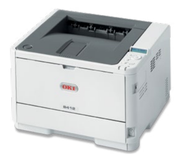
Compact size: the small footprint and sleek design of the B412dn/B432dn make them perfect for desktop and back office environments, even for point of sale