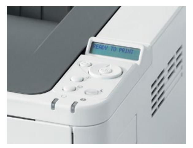
Operator panel: 16-character x 2-line LCD display; convenient access to printer status and menu-driven functionality via large, clearly marked buttons