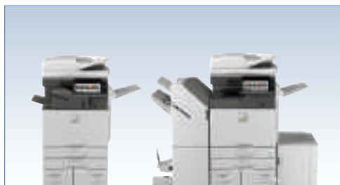
MX-4071 shown in both a compact configuration with inner finisher and full configuration with saddle stitch finisher and large capacity cassette.