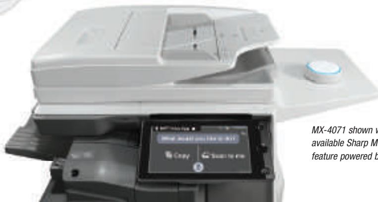
MX-4071 shown with available Sharp MFP Voice feature powered by Alexa.

“Alexa, ask Sharp Copier to scan to me.”