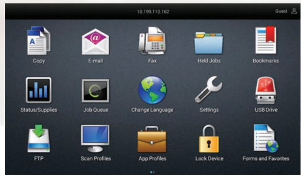
User friendly 7" tablet-style touch screen display.