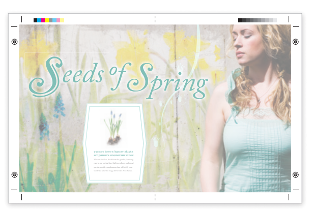
Oversize Output for 11 x 17 bleed

The Xerox® Phaser® 7800 color printer gives graphic arts professionals an impressive range of business-ready finishing options to choose from. Depending on your needs and budget, you can go with the all-in-one Professional Finisher and get stacking, stapling, hole punching, booklet making and v-folding; or start with the Office Finisher LX and get stacking and stapling with the flexibility to add separate hole punching, creasing and stapling capabilities as your workload dictates.